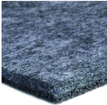
Duralay Kensington Deluxe

Duralay Kensington Deluxe is a new, high performance crumb felt combination underlay ideally suited to woven carpets. The 11mm thick underlay comprises two layers: 6mm of recycled charcoal grey felt provides comfort and “beds in” to the carpet backing, and a 5mm layer of high quality crumb rubber offers a durable and hard-wearing support for the carpet.