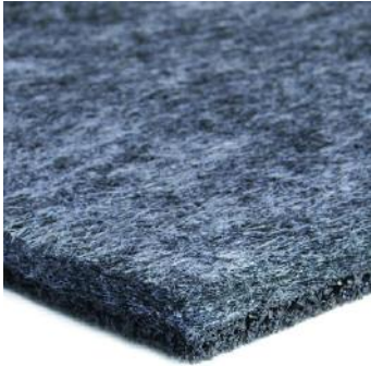
Duralay Kensington Deluxe

Duralay Kensington Deluxe is a new, high performance crumb felt combination underlay ideally suited to woven carpets. The 11mm thick underlay comprises two layers: 6mm of recycled charcoal grey felt provides comfort and “beds in” to the carpet backing, and a 5mm layer of high quality crumb rubber offers a durable and hard-wearing support for the carpet.